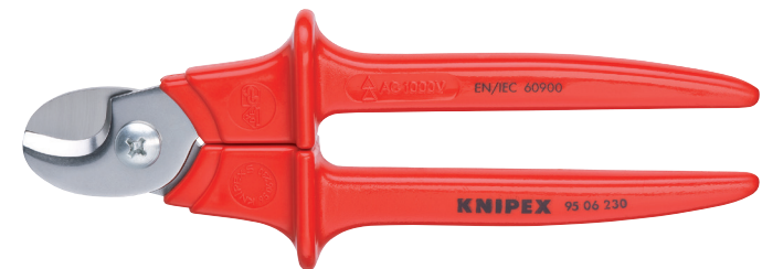
95 06 230 ⚡ 1000V ⚡ ⚡ ⚡ ⚡