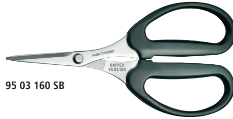
95 03 160 SB

KEVLAR® is a registered trademark of E. I. du Pont de Nemours and Company