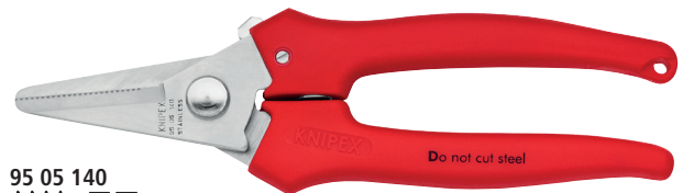
95 05 140 MM