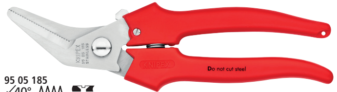
95 05 185 ∠40° MM