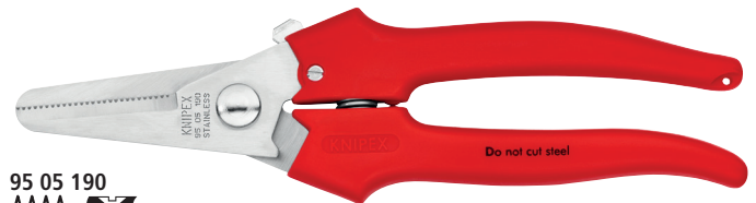
95 05 190 MM

WARNING: This product can expose you to chemicals including lead, which is known to the State of California to cause cancer. For more information go to www.P65Warnings.ca.gov