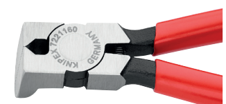
72 21 160 \angle 85^\circ